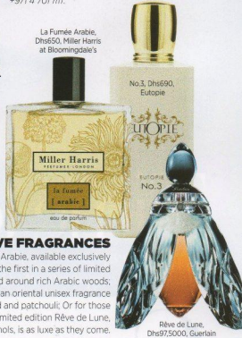
La Fumée Arabe, Dhs650, Miller Harris at Bloomingdale's No.3, Dhs690, Eutopie Miller Harris La Fumée Arabe 1 eau de parfum Réve de Lune, Dhs975000, Guerlain at Harvey Nichols

PRE-PARTY The Nail Spa's Pre-Party Blitz treatment, Dhs812, includes a mani/pedi (including Nail Art or Mixx Nails), waxing, massage and a facial - everything you need to be the beautiful belle of the ball; Spa InterContinental has launched ESPA treatments and products in its spa. Book a treatment this month and choose a gift box from Spa InterContinental's Christmas tree. +971 4 701 1111.