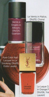
Le Vernis in Malice, Dhs710, Chanel Vernis à Ongles in Aliboum, Dhs124, Guerlain Pure Color Nail Lacquer in Le Smoking, Dhs89, Estée Lauder LE VERNIS MALICE 2 ORANGE FUSION La Laque Couture in Orange Fusion, Dhs106, Yves Saint Laurent